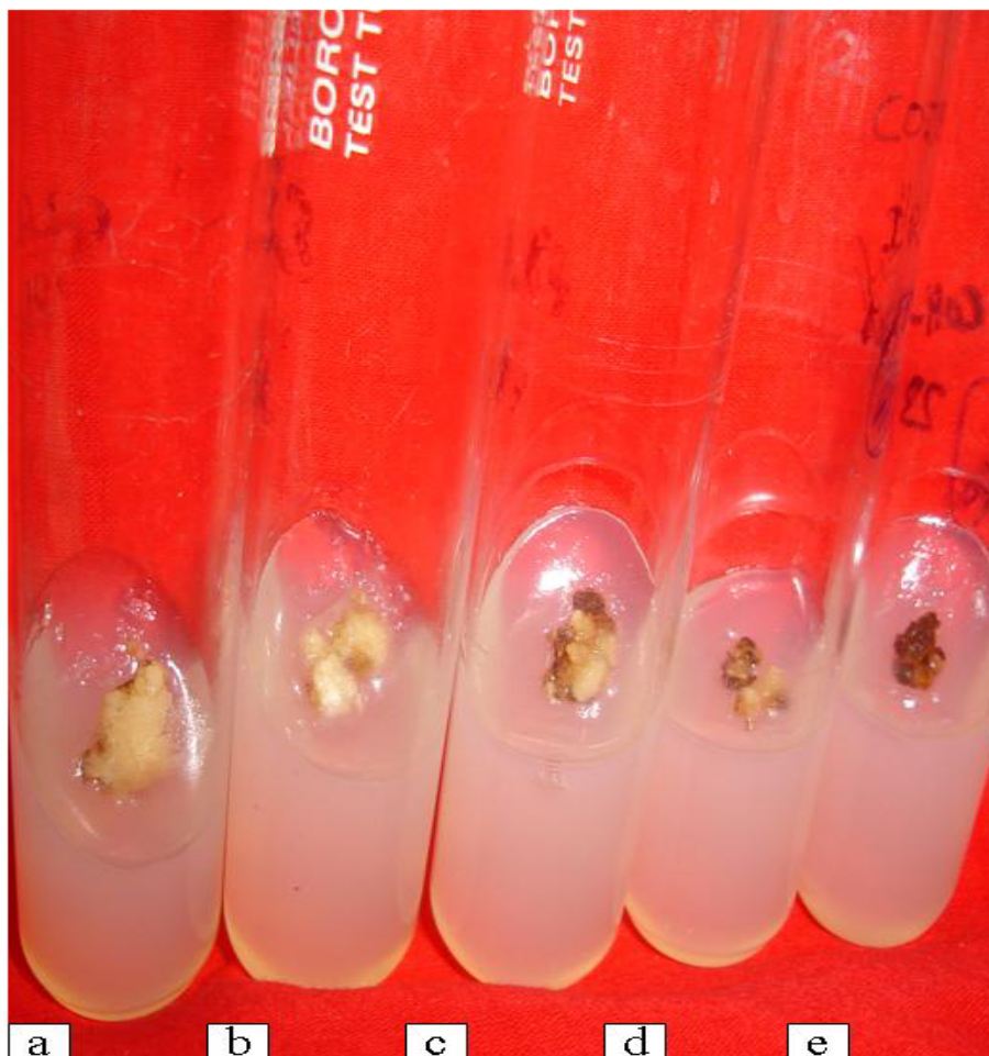
Figure 3. In vitro screening of rice callus for drought stress using different concentrations of PEG (6000). (a) Control, (b) 0.5%, (c) 1%, (d) 1.5%, (e) 2%.